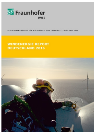
Figure 3: Cover photo for Germany Wind Energy Report 2016. Only available in German. [©Fraunhofer IWES, publication free of charge, copy requested]